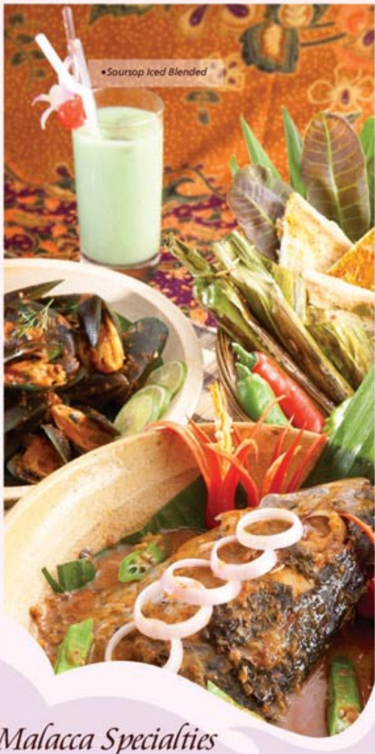
• Soursop Iced Blended